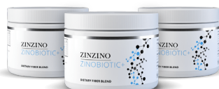
ZinoBiotic+ Start Kit