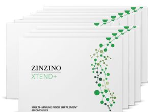
Xtend+ Prepaid Kit