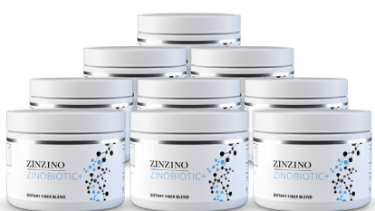
ZinoBiotic+ Prepaid Kit