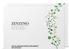
Xtend+ Start Kit