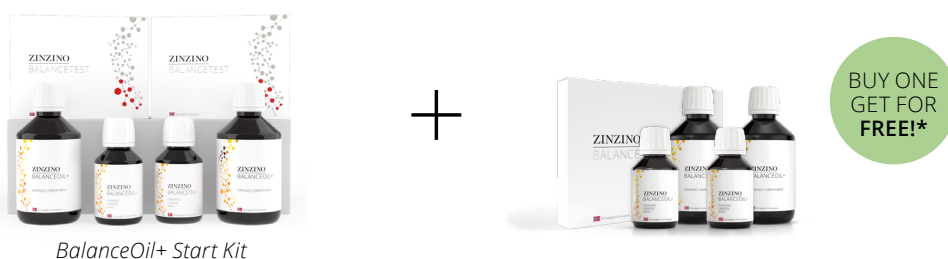
BalanceOil+ Start Kit

4 BalanceOil+ 300 ml, 4 BalanceOil+ 100 ml, 2 BalanceTest *.